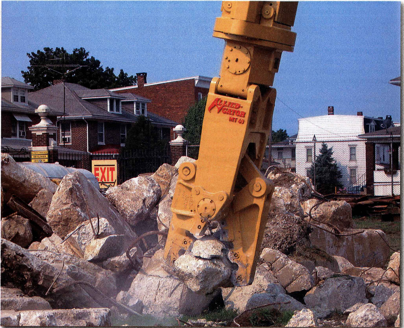
▲ The jaws of an Allied-Gator multi-tool cut through concrete debris and rebar in a snap.

Have you taken an interesting picture of construction equipment at one of your operations? Send it to us, and we may publish it on our Parting Shots page. We'll award the photographer of the best photo we receive this year with a new iPod. Send your photo for consideration to mkuhar@questex.com .