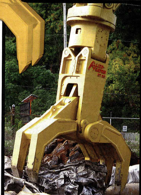
The MT™ Densifier™ Jaw Set is currently available in sizes: MT 20, MT 40, MT 70, MT 90 & MT 100.

Visit www.alliedgator.com to watch footage of the Allied-Gator MT Densifier Jaw Set in action. ■